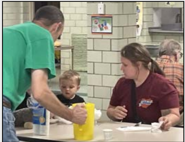
On Saturday, July 19th, St. Jude Council 3904 held an Ice Cream social for the parishioners of Our Lady of Perpetual Help Toledo. The council had a variety of toppings available and fun was had by all attendees.