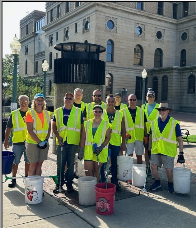
Members of Holy Martyrs Council #4733 in Canton gather the 4th Saturday morning every month to pick up litter in the downtown area as part of their community improvement efforts.