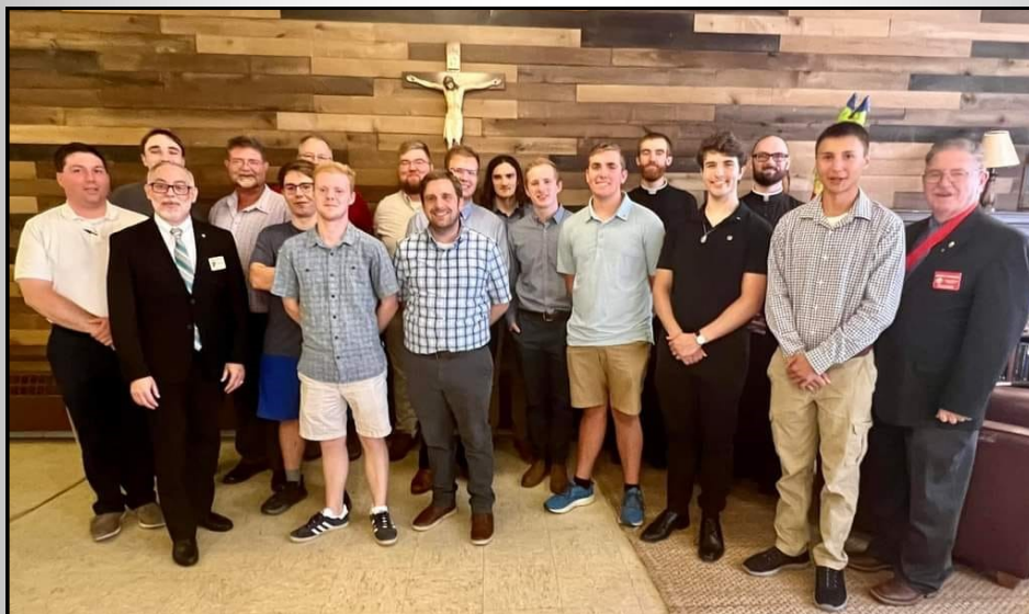
A new Council with 20 men was launched at St Mary's Parish and Miami University/ Newman Center in Oxford, Ohio! Congratulations to these men joining our order... of the 20 men, 14 are new members with an average age of 20!