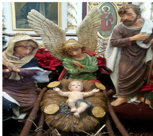
A part of the Nativity Scene at Holy Trinity Ukrainian Catholic Church in Youngstown, OH (2014 A.D.)