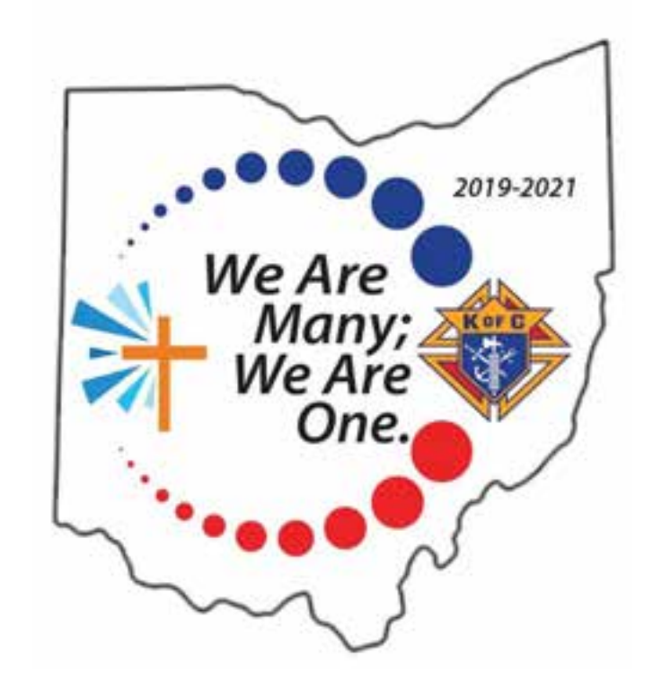
State General Program 2019 – 2021